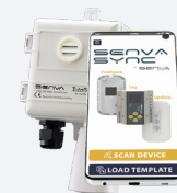
Senva Sync App